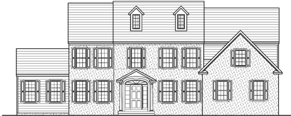
ELEVATION B: Stucco, Vinyl Siding & Stone Facade Shown With Optional Sunroom, Dormers, & Elliptical Front Pent Roof